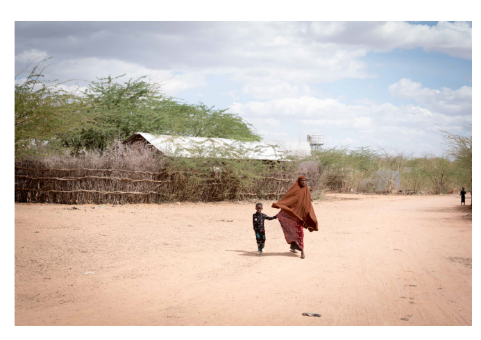
A child and a women in a thorough fare in Dagahaley camp. Dagaheley is in the arid north-eastern part of Kenya, where scorching mid-day heat can often become unbearable.

tal admissions declined in 2020 owing to movement restrictions and fear of COVID-19. MSF staff conduct at least 700 lifesaving surgeries on average per year in Dagahaley, including caesarean sections. In 2020, MSF also assisted almost 2,956 deliveries all through the year.