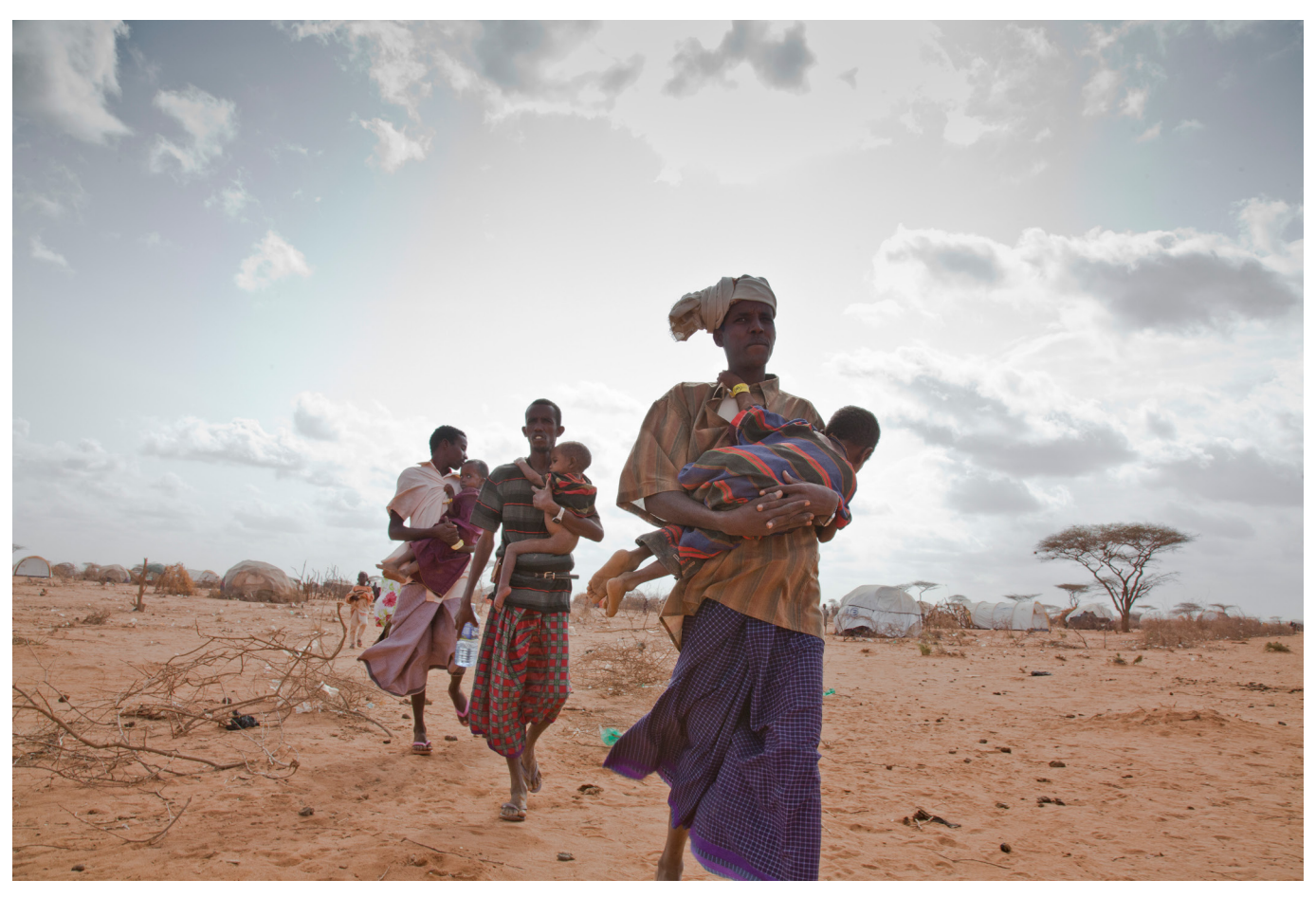
Somali refugees in Dadaab refugee camp carry their sick and malnourished children to a new feeding center run by MSF at the outskirts of the sprawling refugee camp.

The year 2021 marks the 70th anniversary of the 1951 Refugee Convention. To mark this key milestone, the UN High Commissioner for Refugees, Filippo Grandi, has emphasised that the "Convention is clear as to the rights of refugees and remains applicable in the context of contemporary and unprecedented challenges", and has appealed to governments "to uphold the key principles of refugee protection as laid out in the Convention" <sup>27</sup>. Besides explicitly prohibiting refoulement, the Convention encourages hosting states to provide refugees with wage-earning employment and social security as well as to facilitate their free movement within their territory.