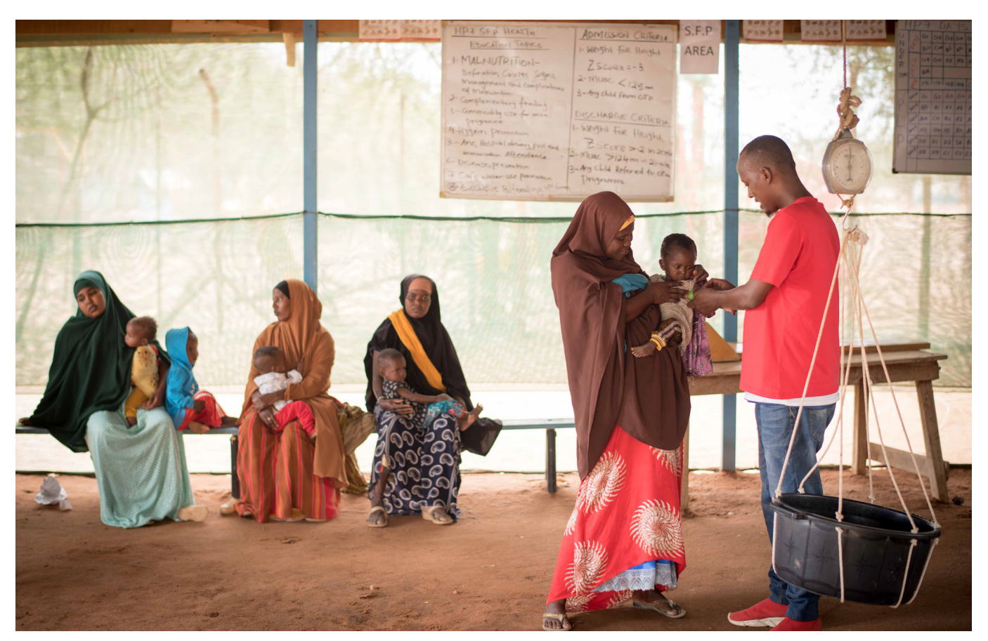
An MSF health worker measures the upper-mid-arm circumference of a child in a health post run by MSF in Dagahaley refugee camp.

place, refugees instead see their decades of encampment as the cost they have already borne to earn a life where they can move, work and live freely, in safety and dignity.