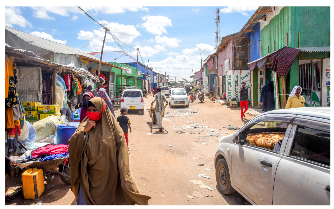
Refugees and host communities trade wares in this market in Dagahaley camp.

Given the poor record of resettling refugees living in long-term displacement, especially from the Africa region, UN-HCR should mobilise states to pledge increased resettlement slots during the High Levels Official Meeting. The meeting will be held in December 2021 to take stock of progress made in achieving the objectives of the Global Compact on Refugees. Next year, the UN Secretary General and UNHCR should bring together a critical mass of states to organize a solidarity conference for refugees in Kenya who risk no longer having access to protection following the camp closure.