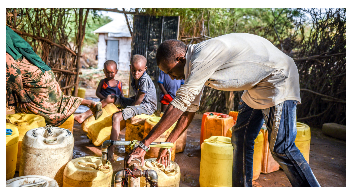
Refugees collect water at a water point in the camp