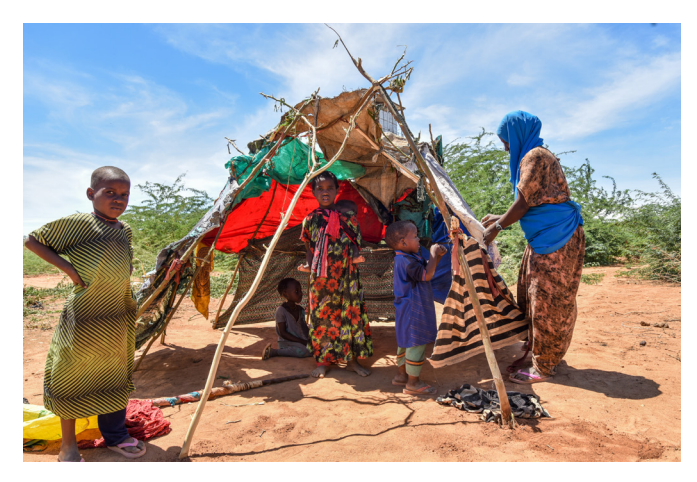
A new family arrives in Dagahaley and sets up a makeshift tent which will be their new shelter

Camp experience is gendered, with women encountering additional challenges. Many women respondents in Dagahaley noted that they were subjected to early marriages, frequently suffered gender-based violence and experienced discrimination when seeking employment. They noted that most jobs in the camp were held by men and the few who were engaged as volunteers confided that they underwent torture and harassment in their jobs. While some of these practices may be widespread irrespective of whether women live in camps or outside, what aggravated their condition, according to many, was that most men in the camps had little to occupy themselves with and felt helpless. This meant they off loaded their frustration on to women, often by being violent. At the same time, women also ended up doing all the hard work of managing the household, looking for firewood and caring for children.